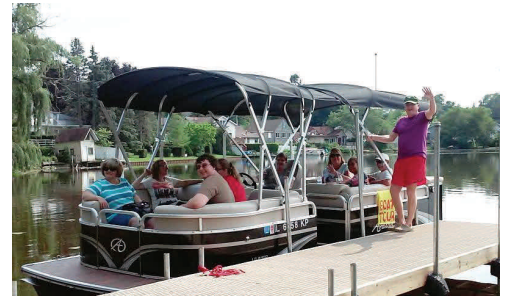
Historic Boat Tours

Island Lake Boat Tours! A docent-guided pontoon boat tour highlight points of interest of Island Lake. Relax, enjoy the view and hear the stories of Island Lake. They will do about 10-12 tours per season. They love groups tours of 8 - 10! Season typically runs from July through September. Reservations required. $10 donation at time of tour. Call Liz Nelson at 847-609-9050 for more information or email her at lizznelson@me.com. Visit the society at www.facebook.com/Historical-Society-of-Island-Lake.