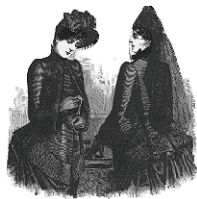
Victorian Mourning Dress

The McHenry County Historical Society Museum will mark its 40th year Friday, April 29, with a celebration of an American staple: Beer. To mark the resurgence of independent craft breweries to the county, the society has created an exhibit that chronicles the history of brewing and taverns here. The exhibit will feature current local craft breweries, as well as historic breweries from the county's past. "Bottles, Barrels & Brews: McHenry County on Tap" features historic photographs, old beer bottles, beer crates, barrels and other items related to McHenry County's historic breweries – including a re-created speakeasy, the Bubbling Over. $15 inc. pint glass & 5 tasting tickets. The museum will be open from 1 to 4 p.m. the first four Sundays in May.