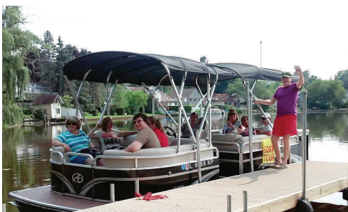
Historic Boat Tours

Also enjoy Historic Island Lake Boat Tours! A docent-guided pontoon boat tour highlight points of interest of Island Lake. Relax, enjoy the view and hear the stories of Island Lake. They will do about 10-12 tours per season. They love groups tours of 8 - 10! Season typically runs from July through September. Reservations required. $10 donation at time of tour. Call Liz Nelson at 847-609-9050 for more information or email her at lizznelson@me.com . Visit the society at www.facebook.com/Historical-Society-of-Island-Lake .